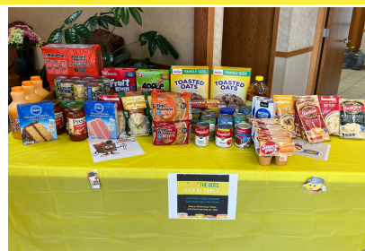
Can the Boss Food Drive