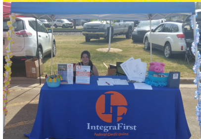
Library in Bloom