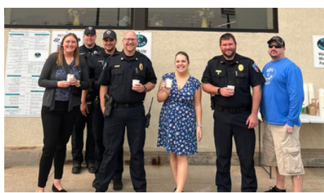
Coffee & donuts with a cop day