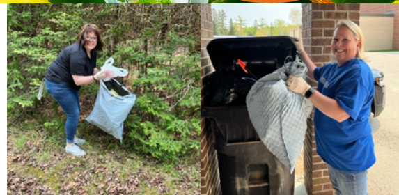
Do something good for your neighbor