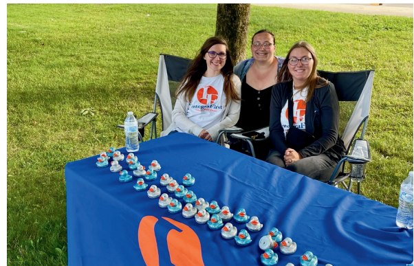
Team Integra in July at Family Fun Night in Menominee.

Daylight Saving Time ends on Nov. 3 at 2 a.m. Mark your calendars and soak up the sun for a bit longer!