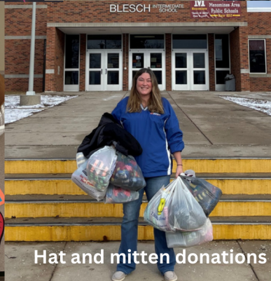
Hat and mitten donations