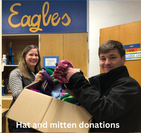
Hat and mitten donations