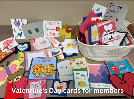
Valentine's Day cards for members