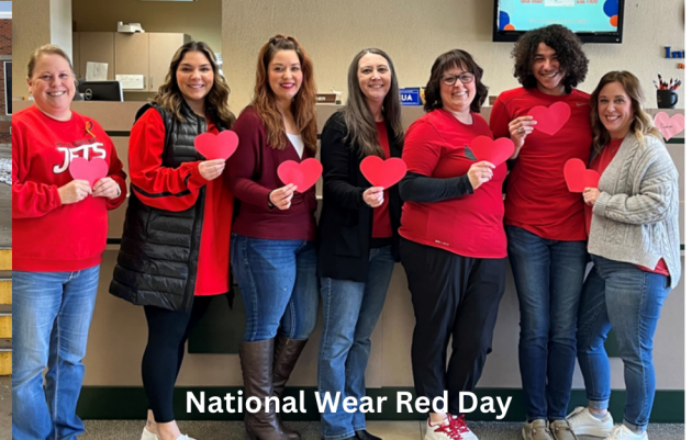
National Wear Red Day