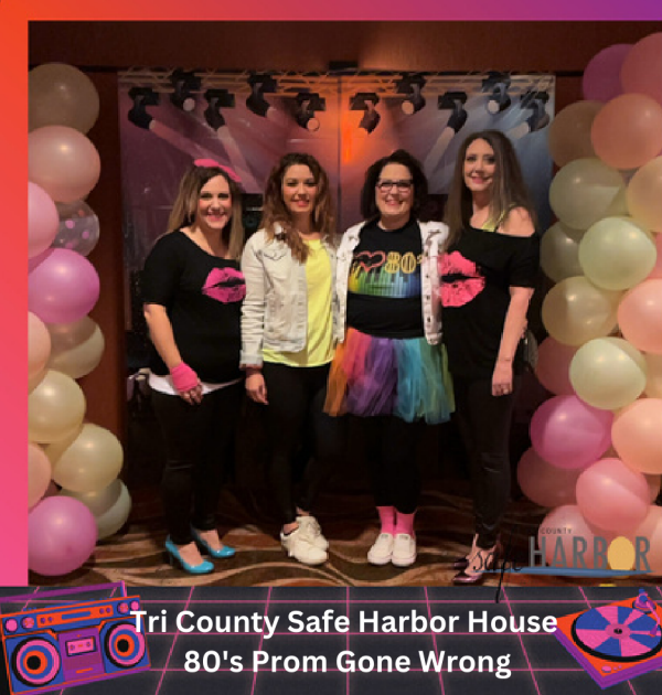
Tri County Safe Harbor House 80's Prom Gone Wrong

We also were the recipient of a Random Act of Kindness when three children brought us thank you cards for everything we do in the community. We were so thankful for their kindness!