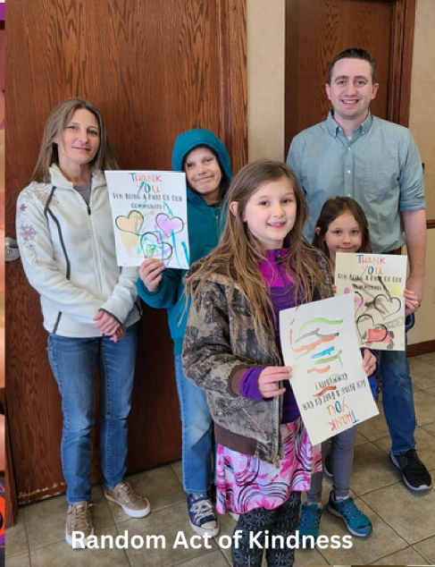
Random Act of Kindness